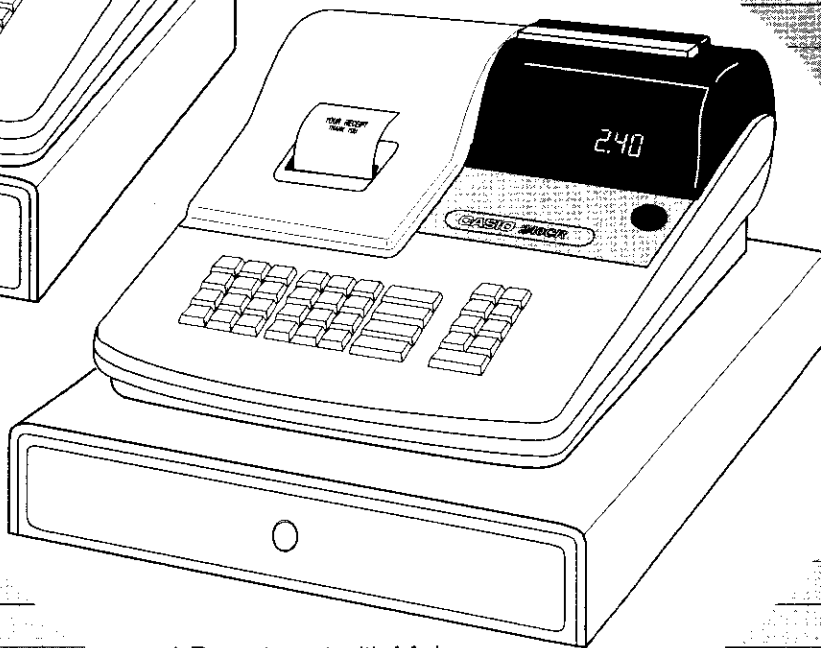
4-Department with M drawer